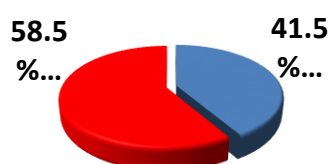
Figure 1: Parathyroid hormone level in patients with chronic renal failure.

About 34(41.5%) of CRF patients depicted a PTH level of less than 130 pg/ml and 48(58.5%) depicted higher level of \geq 130 pg/ml which is considered secondary hyperparathyroidism (SHPT) [Figure 1].